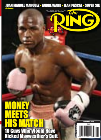
Cover Design by David Romanosky